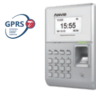
TC530 (The GPRS T&A Terminal)