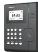
OC180 (Classic, Ultra-thin RFID Time Attendance)