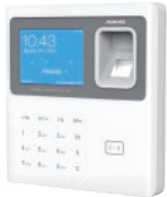
W1 (New Color Screen)