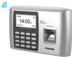
A300 (World Popular Model)