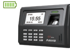
EP300 (The Best Combination of Function and Price)