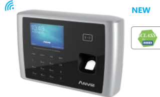
A380 (Color screen)