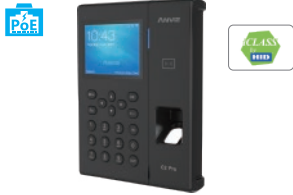
C2 Pro (Professional Fingerprint & Card Terminal)