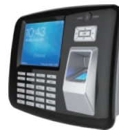
OA1000 Mercury Pro (Live Scan)

Lumidigm Wet Fingerprint Dirty Fingerprint Oil Fingerprint