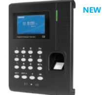
C2 (World thinnest design)