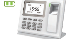
D200 (Super Slim & Flexible)