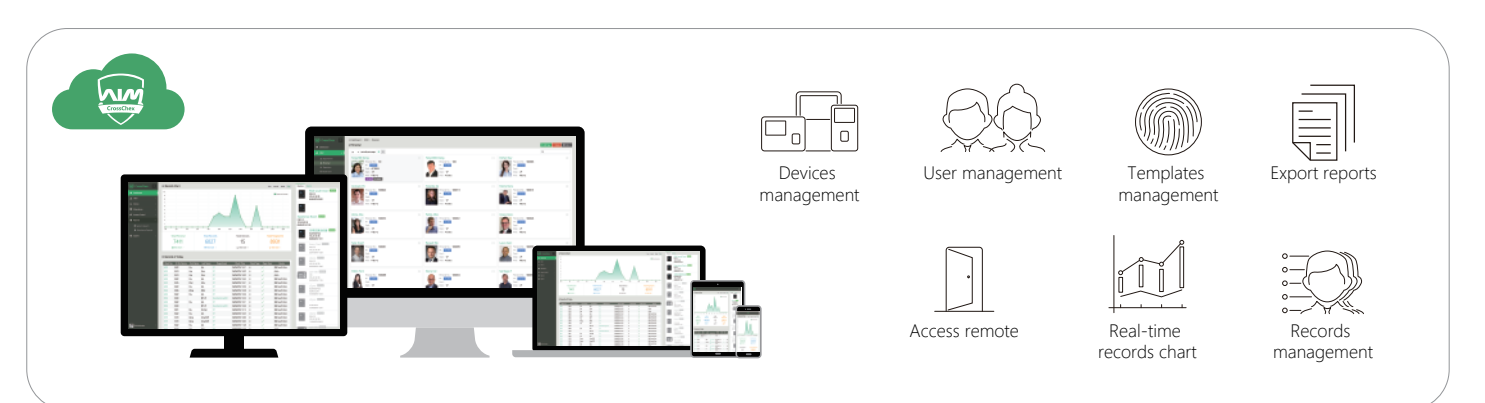
Remote Cloud Management